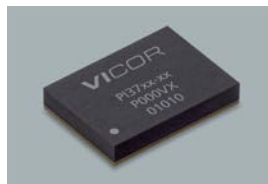
ZVS buck-boost regulators