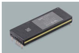
BCM6123 bus converter