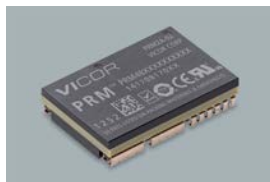
PRM buck-boost regulators