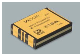
NBM2317 DC-DC converter