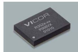
ZVS buck regulator