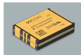
NBM2317 DC-DC converter