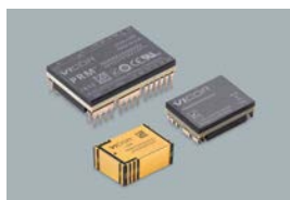
PRM buck-boost regulators