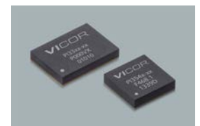
ZVS buck regulators

Inputs: 12V (8 – 18V), 24V (8 – 42V), 48V (30 – 60V)