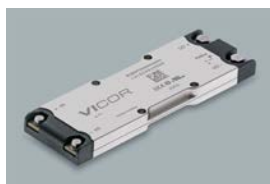
BCM4414 bus converter