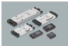
DCM DC-DC converters