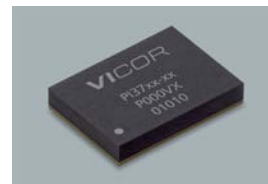
ZVS buck-boost regulators